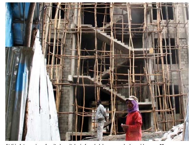
At this future wing of a city hospital, six female laborers work alongside some 60 men.